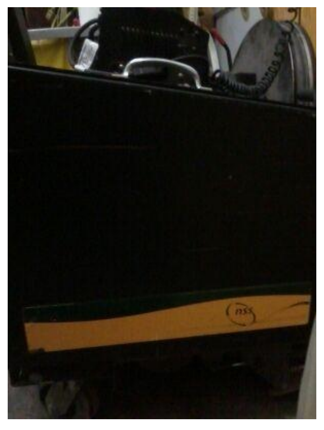
Slant Top Machine