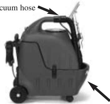
Attach vacuum hose