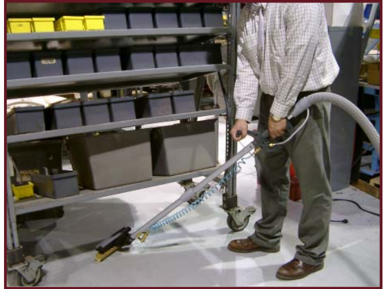
Optional off-aisle wand shown.

The SCV™28/32 offers an optional on board off-aisle wand and squeegee tool ideal for cleaning areas where the machine cannot go. The telescopic wand adjusts for operator comfort. Compact and lightweight, the tool can be conveniently attached to the rear of the machine and always available for use.