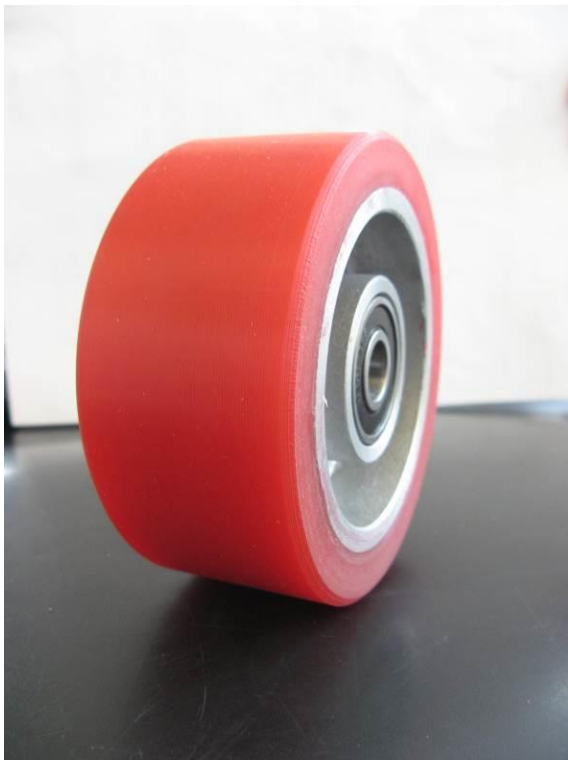
Wheel 100/40 for smaller machine range

Please note that the wheels are delivered as single parts without any extras, such as thread guards or mounting materials. These have to be taken over from the existing castors.