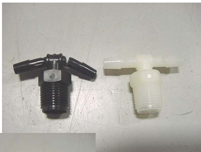
Fig 3- New Tee fitting is made from Nylon, has 2X the tensile strength of the original fitting made from HDPE and is significantly more ductile to prevent fractures.

New fitting is white in color to aide in distinguishing it from the original fitting.